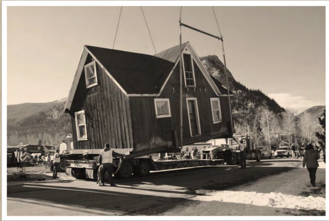
Excelsior Mine Office Building Preservation Project 2018

Lead Opportunities for Historic Preservation, and Education