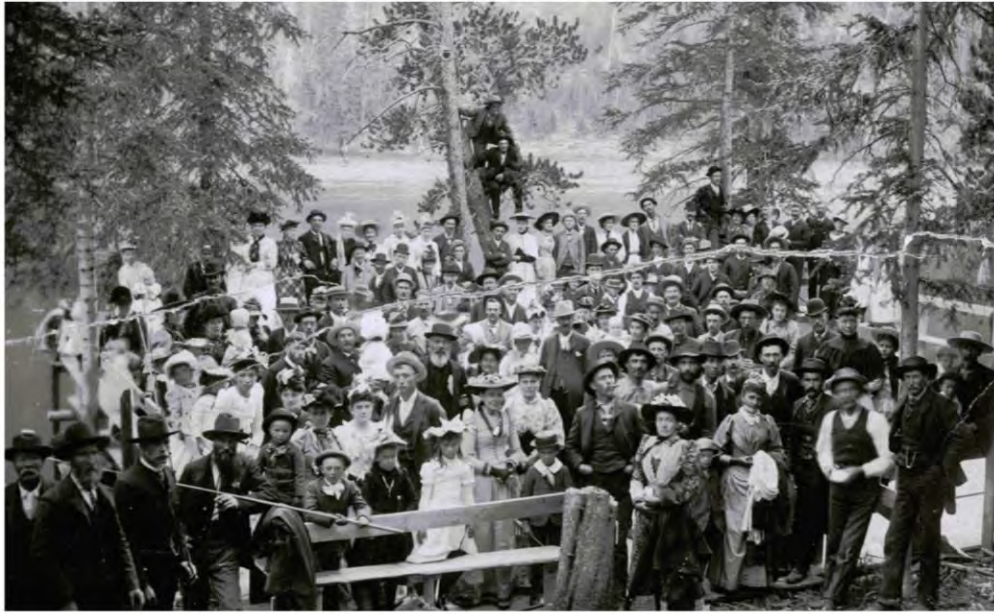
Robinson and Kokomo Odd-Fellows Picnic at Uneva Lake - Ten Mile Canyon