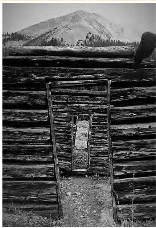
Independence City, CO 2017

This five year Strategic Plan for 2019-2023, adopted by Frisco's Town Council in 2018, outlines and guides the direction and priorities for the Town of Frisco Historic Park & Museum. We inform and involve the Frisco community and visitors by upholding a strong, transparent, and thriving museum which leads and builds Frisco's future in preservation, culture, and heritage.