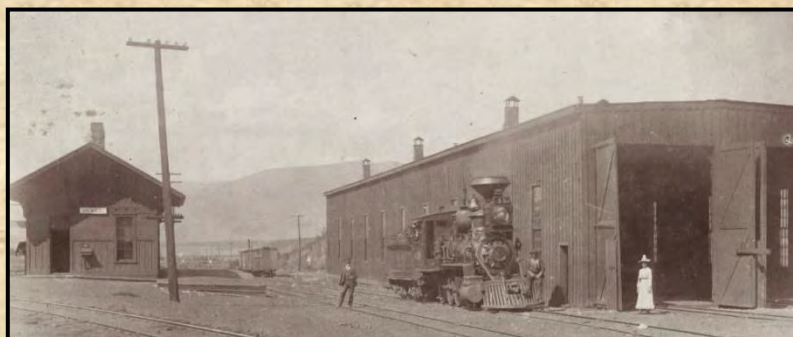
Dickey Depot and Engine House c. 1880