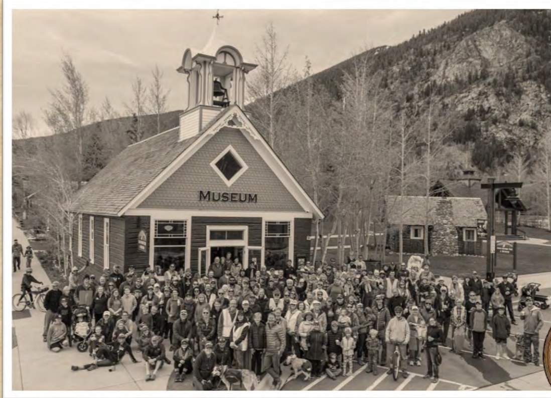
35 th Anniversary Community Photo 2018